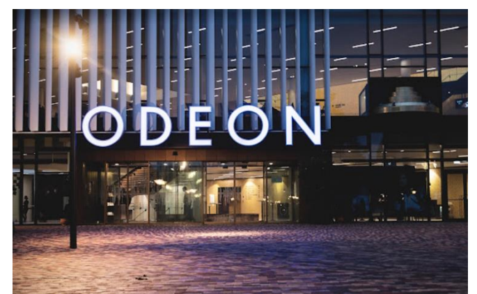
The Odeon, Odense, Denmark

ROSCon 2024 Conference MeetGreen® Calculator 2.0 score was in the Visionary category. This shows an increase from the 2023 conference. The city is working towards 100% renewable electricity and heating by 2030.