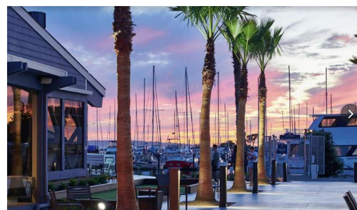
Doubletree Berkeley Marina